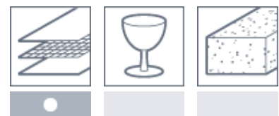
Composite Glass and Ceramics Stone