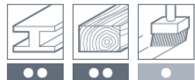
Metal Wood Lacquer